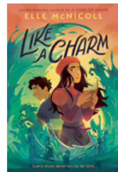
Like a Charm by Elle McNicoll