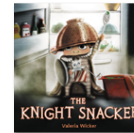
The Knight Snacker by Valeria Wicker